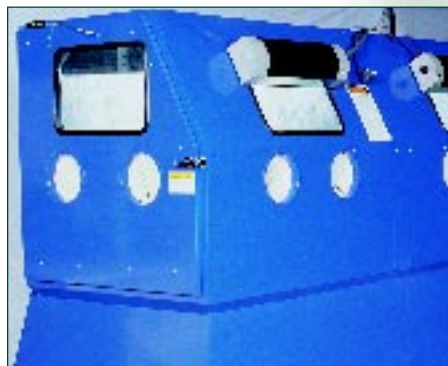
Double Cabinet with additional operator station