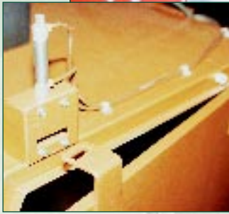
BNP 720 with Vertical Lift Door

Mounted on one side (or both on select cabinets), vertical lift doors reduce the floor space required to swing open a conventional door. This is especially useful with a work car. Available on our Pulsars and BNP 65, 220, 600, 720, and double cabinets, the pneumatically operated doors open with a switch.