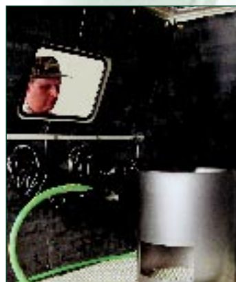
Alox Kit includes rubber curtains for cabinet

Protect your investment from aggressive abrasives with rubber curtains for the cabinet interior walls and doors, and a longer-wearing boron carbide nozzle. Curtains available in black or super reflective white.