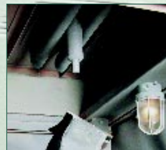
Rotating Angled Nozzle on Vertical Oscillator