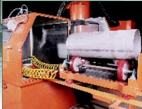
Roller mounted on powered work car

Manual or powered rollers rotate gas cylinders and other tube-shaped parts for all-over blasting. Mounted on a work car, rollers speed loading and unloading of these cumbersome parts.