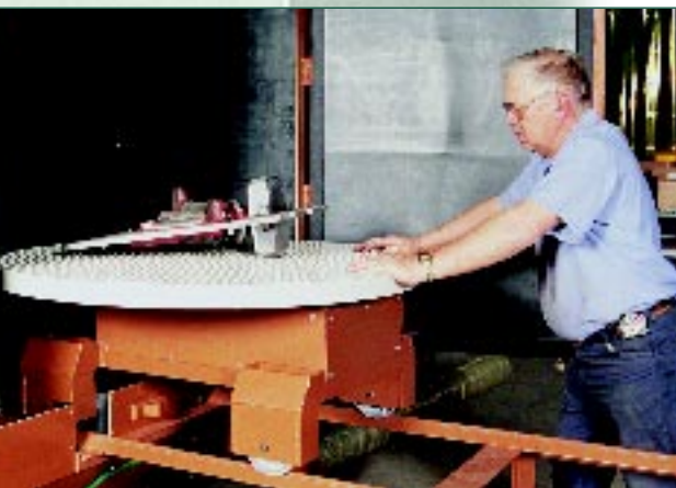
Turntable mounted on manual work car

Take the strain out of manually loading heavy or awkward parts. Our standard work car and turntable combinations carry up to 500 pounds. Higher-capacity work cars, with or without turntables, require additional cabinet bracing and are offered only as factory installations. A work car can be fitted with just about any parts handling system, from rollers to turntables to fabricated fixtures – whatever it takes to make the job easier, faster, or better.