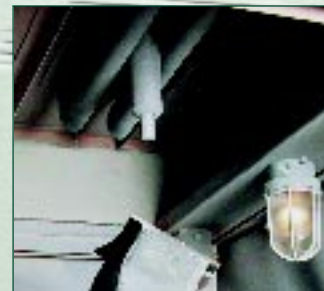
Rotating Angled Nozzle on Vertical Oscillator