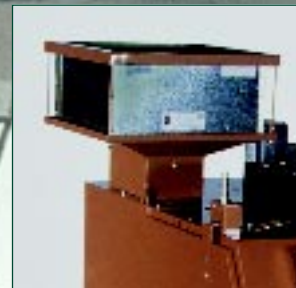
HEPA filter on Pulsar III

Our standard reverse pulse cartridge dust collectors trap 99.7 percent of dust particles as small as 0.5 microns. A High Efficiency Particulate Air (HEPA) filter captures 99.97 percent of the remaining dust particles (down to 0.3 microns). Our freestanding HEPA filter connects to any existing Clemco RP collector, and our top-mounted HEPA filters work with the Pulsar all-in-one blast cabinets.