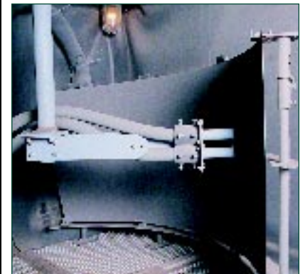
Vertical & Horizontal Oscillator in BNP 720

Heavy-duty construction already makes ZERO cabinets among the quietest you can buy; now we offer additional sound-deadening for applications where noise levels are strictly enforced. Depending on your requirements, our engineers can relocate and muffle the air inlet and exhaust and apply sound-deadening foam to reduce noise levels outside the cabinet.