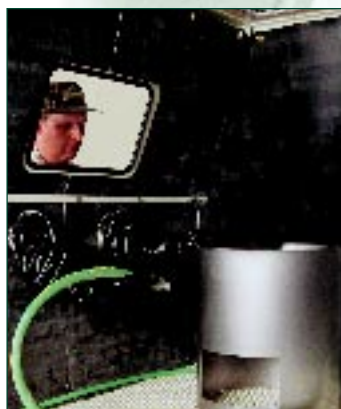
Alox Kit includes rubber curtains for cabinet

Protect your investment from aggressive abrasives with rubber curtains for the cabinet interior walls and doors, and a longer-wearing boron carbide nozzle. Curtains available in black or super reflective white.