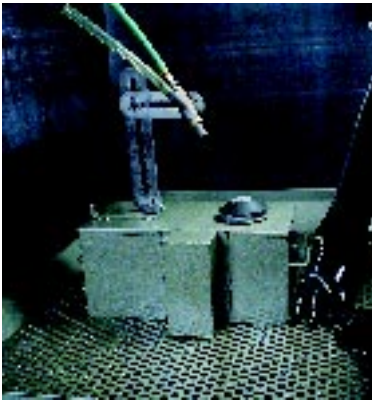
A-250 Automation Kit